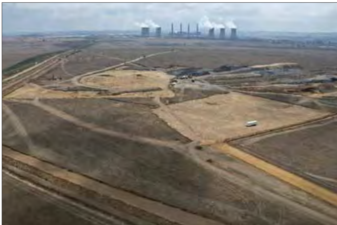
Aerial view of Coal of Africa Limited's < Mooiplaats coal project

The investment made by GCM has already experienced significant value appreciation. GCM has invested (including costs) £4,783,000 which was valued at £40,600,000 (as at 30 June 2008) 1 .