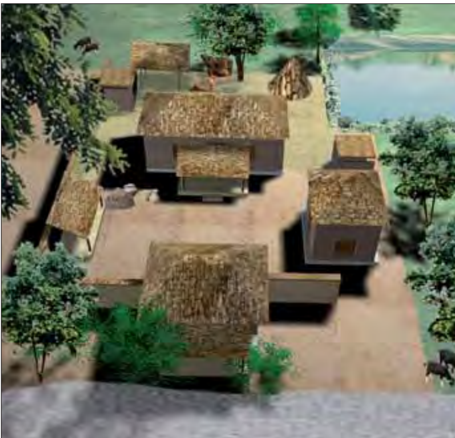
< Conceptual style for new housing

The development of the Phulbari Coal Project remains our primary objective in achieving our vision and we remain committed to working with all stakeholders to provide a new and reliable source of energy to fuel the growth of the Bangladesh economy.